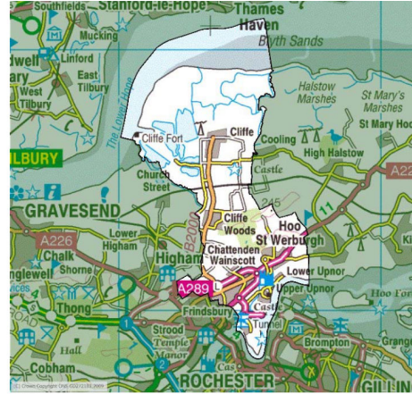
Maps reproduced by permission of Ordnance Survey on behalf of HMSO. © Crown copyright and database right 2009. All rights reserved. Ordnance Survey Licence number ONS.GD772183